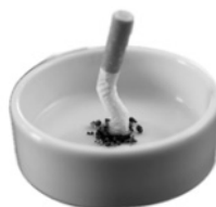
"The Butt Stops Here"

Once the employer has established the program, members can be referred to the program by their Piedmont Primary Care Physician, by self-referral, or through the employer Health Risk Assessment (HRA) if it is offered by your company.